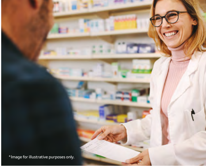
*Image for illustrative purposes only.